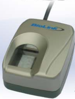
BioLink U-Match@ MatchBook v 3.5