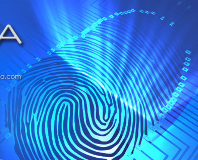
Tartarus™ BII™ based Prison Management System